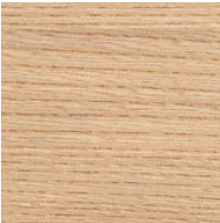
Castor aralia Soap