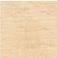
Beech Natural white