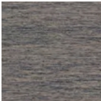
Beech Medium grey