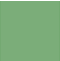
Aluminum SG green