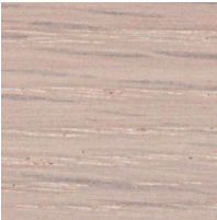
Oak Snow white