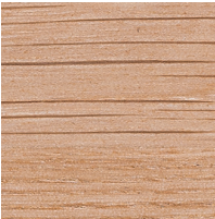
Oak Natural white