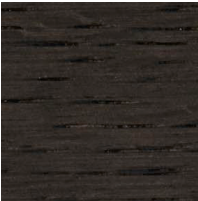
Oak Charcoal grey