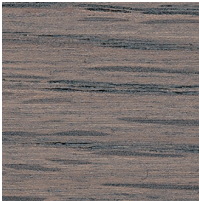
Oak Medium grey