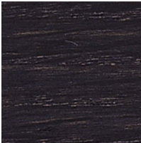
Oak Tannin black