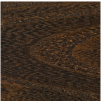
Zelkova Tannin black