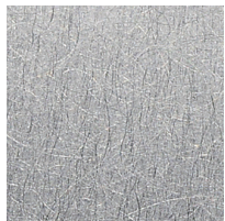
Stainless Vibration finish