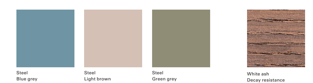
DD-015 garden bench W1137×D522×H765×SH451

DD-014 garden stool W420 \times D420 \times H457 \times SH457