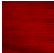
Cypress Red shunkei