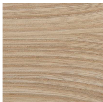
Castor aralia Soap