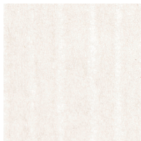
Japanese paper Stripe