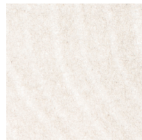
Japanese paper Wave