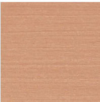
Bronze Satin finish