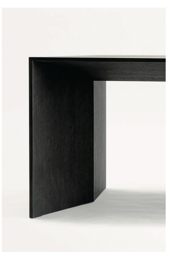
CO Designed by Kengo Kuma

In line with the architectural design by Kengo Kuma, we challenged ourselves to thin down the wooden table to the utmost limit to realize a slim, sharp appearance with only wooden materials, instead of using the aluminum honeycomb panel. We created thin, delicate edges for both sides of the table while the use of a thick, inclined top board toward the centre added strength. This wooden table was designed in pursuit of the ultimate lightness by applying structural dynamics from an architectural perspective.