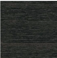
Beech Charcoal grey