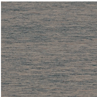
Beech Medium grey