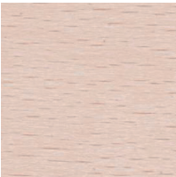
Beech Snow white