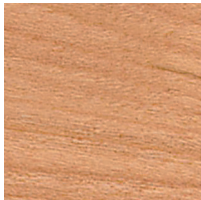
Wild cherry Beeswax