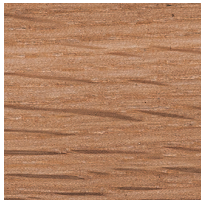
Japanese oak Beeswax