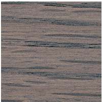
Oak Medium grey