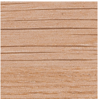
Oak Natural white