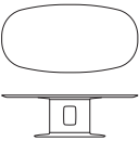
T-721 dining table W2400×D1200×H740