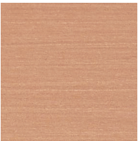
Bronze Satin finish