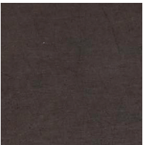
Bronze Black stain