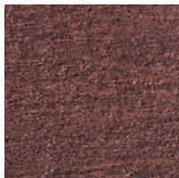
Beech Mahogany colour