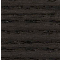
Japanese oak Tannin black