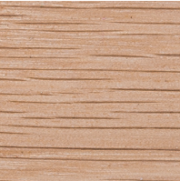
Japanese oak Soap