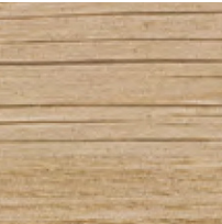
Oak Natural white