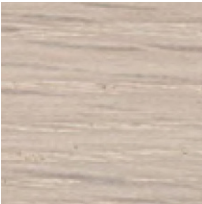
Oak Snow white