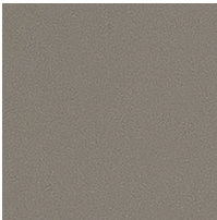
MDF Light grey