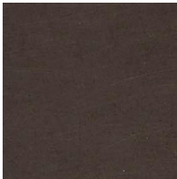
Brass Black stain