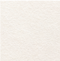
Japanese paper Plain