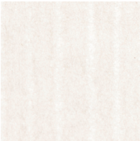
Japanese paper Stripe