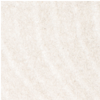
Japanese paper Wave