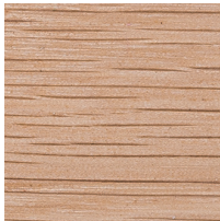
Japanese oak Soap